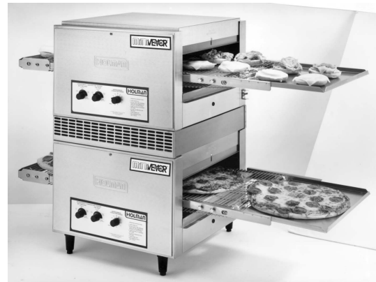
Miniveyors Double Stacked

Miniveyor ovens are covered by Holman's one year parts and labor warranty.